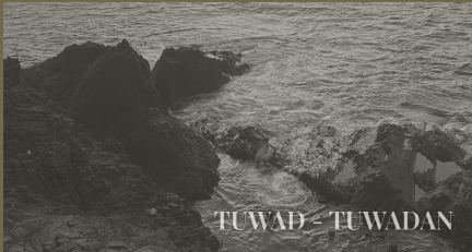
TUWAD = TUWADAN